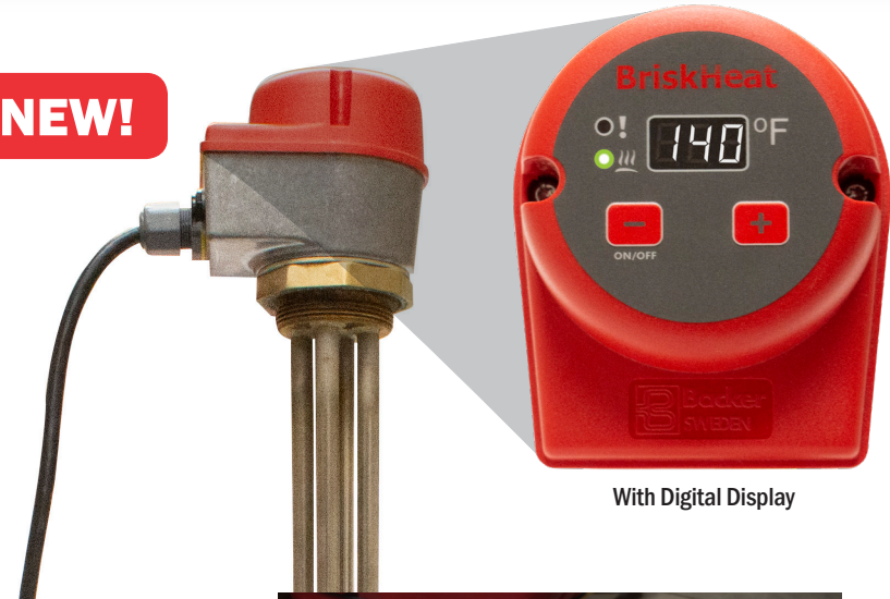
With Digital Display