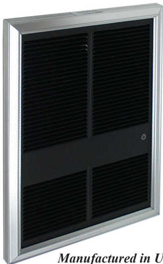
Manufactured in U.S.A.