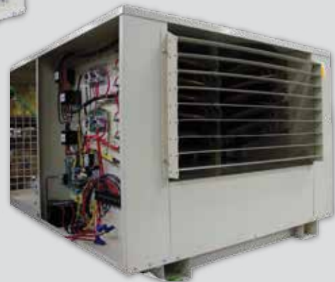
Motor & Blower